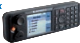
REMOTE CONTROL HEAD