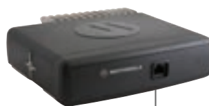
REMOTE MOUNT CAR, AMBULANCE, FIRE TRUCK