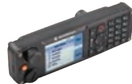
IP67 CONTROL HEAD