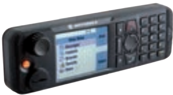
REMOTE ETHERNET CONTROL HEAD (ReCH) SUPPORTS EXTERNAL SPEAKERS AND PTT