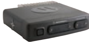
EXPANSION HEAD ENHANCED STD AND AUXILARY 25 PIN AND RS232