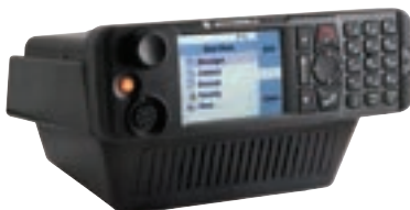
DESK MOUNT CONTROL CENTRE