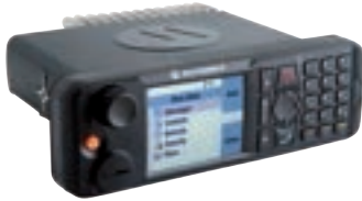
DASH / DESK CONTROL HEAD