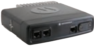
ETHERNET EXPANSION HEAD 2X STD, ETHERNET TYPE, ETHERNET SIM READER AND RS232