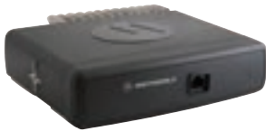
EXPANSION HEAD SINGLE STD CONNECTION