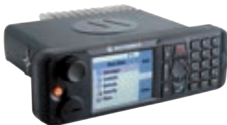
DASH MOUNT CAR, TRUCK