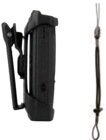
PMLN7605A Carry Case