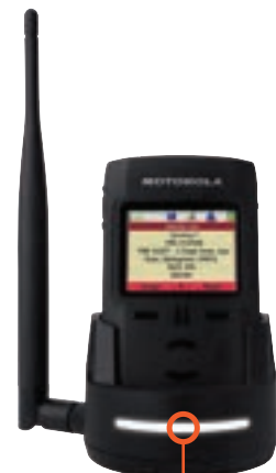
PMPN4142A Home Station